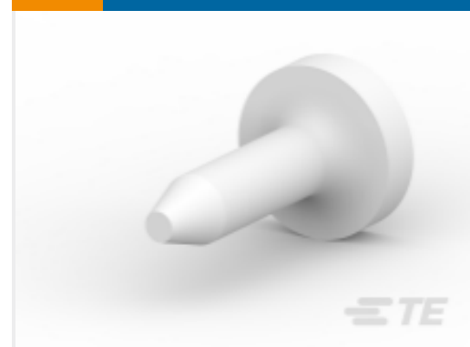
TE Part # 206509-1 SIZE 20 KEYING PLUG