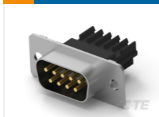
TE Part # 2-745492-0 PLUG ASSY, 9P, HDE, MS