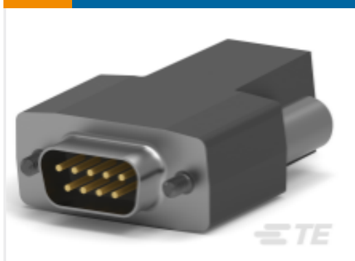
TE Part # 1-747944-6 KIT, PLUG, 9P, HDE, SHLD ENCLSRE